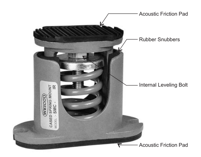
Cased Spring Mount with Internal Adjustment and Neoprene Pad on top (add suffix 'IR')