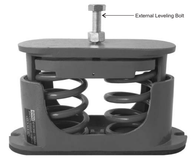
Cased Spring Mount with External Adjustment (supplied as standard)

Spring mount cartons contain detailed installation guide.